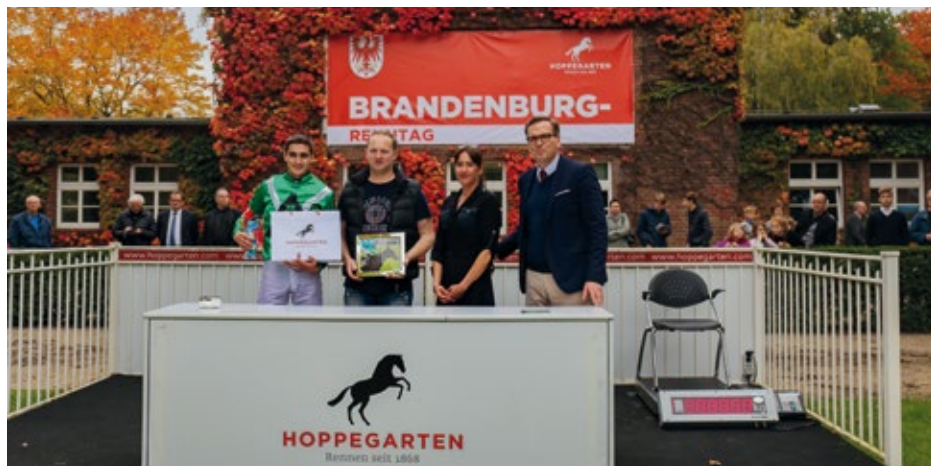
Winners Ceremony Gentlemen Riders in Berlin-Hoppegarten, Germany