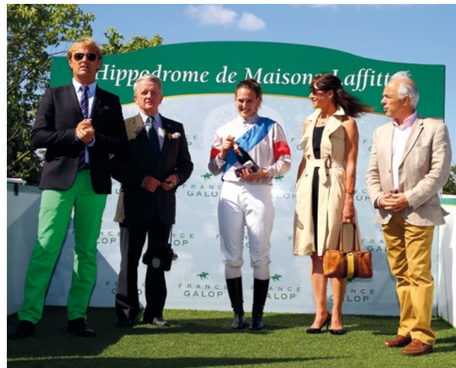
Winning ceremony of the Prix du Conseil Départemental des Yvelines in Maisons-Laffitte, France