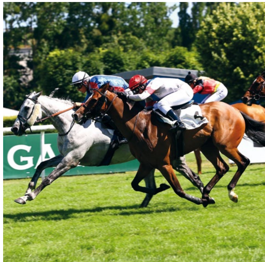
Prix du Conseil Départemental des Yvelines in Maisons-Laffitte, France

France and Italy can both be proud of their efforts and courage. They respectively finished fourth and fifth in the ranking.