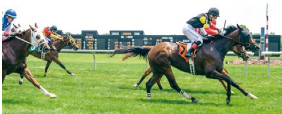
Lady Riders in Delaware, Usa