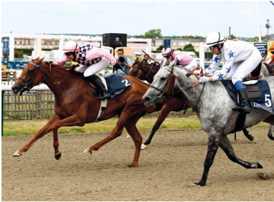
Lady Riders of the Prix de la Reine Amélie in CHantilly, France