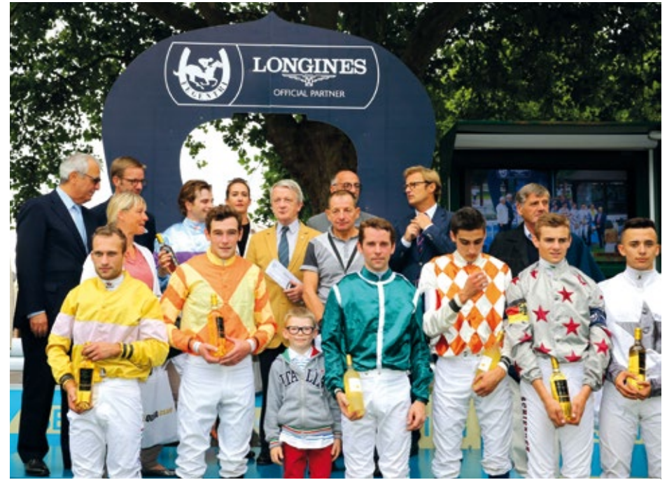
Gentlemen Riders of the Prix Georges Courtois Equidia Live in Deauville, France