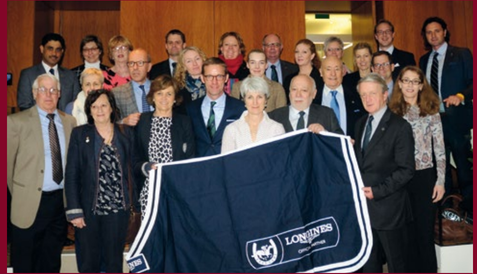
Members reunited during 62 nd General Assembly