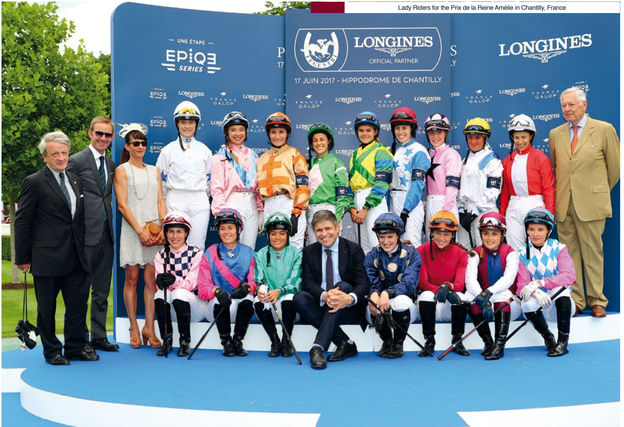
Lady Riders for the Prix de la Reine Amélie in Chantilly, France