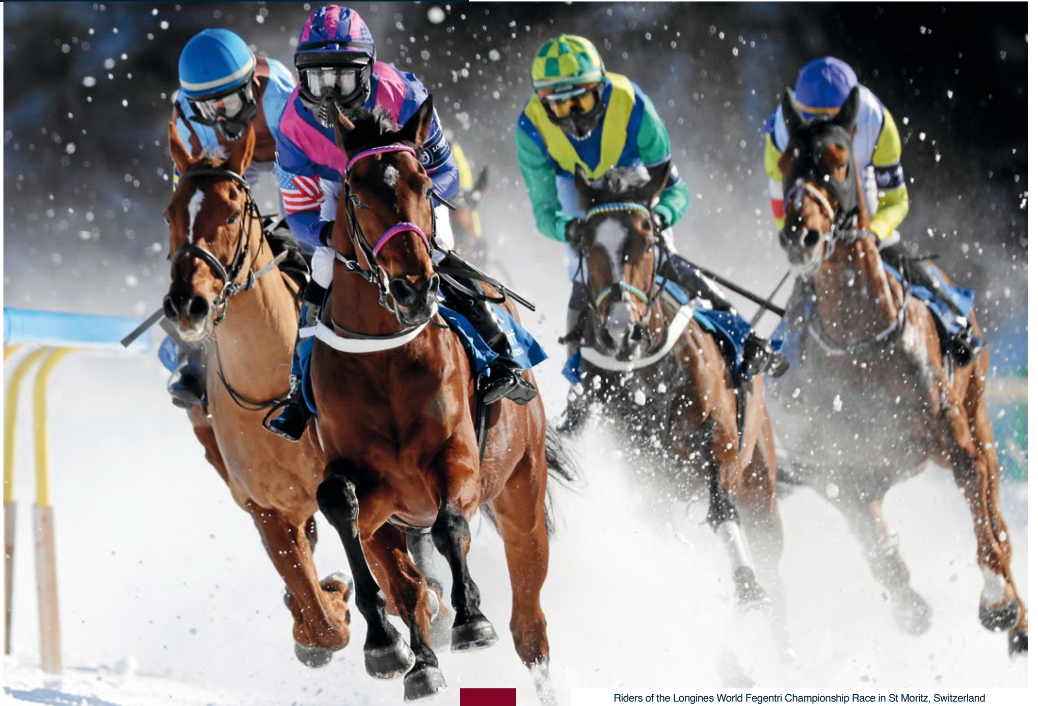
Riders of the Longines World Fegentri Championship Race in St Moritz, Switzerland