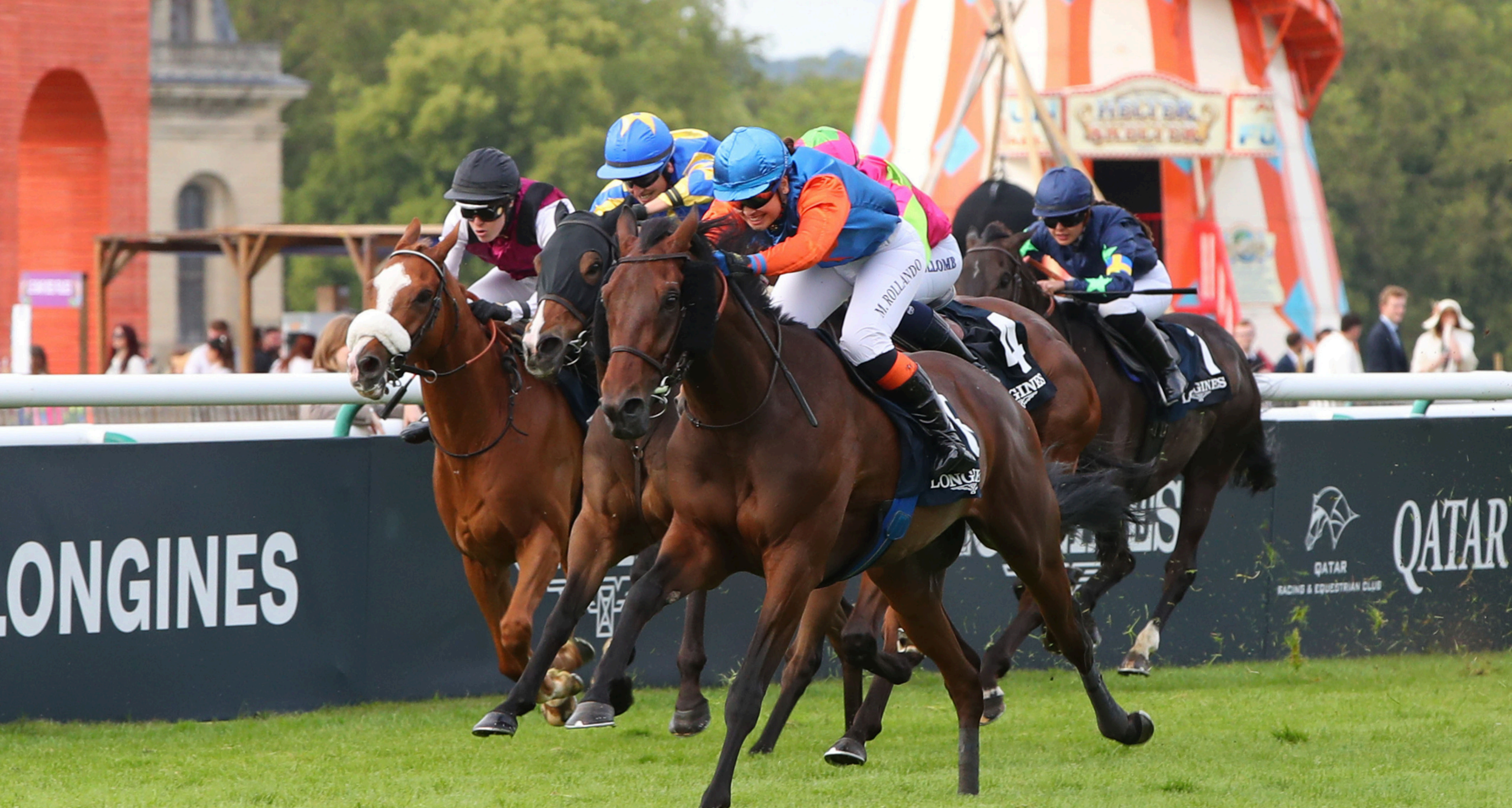
Lady riders riding the FEGENTRI Prix de la Reine Marie-Amélie, Chantilly, France