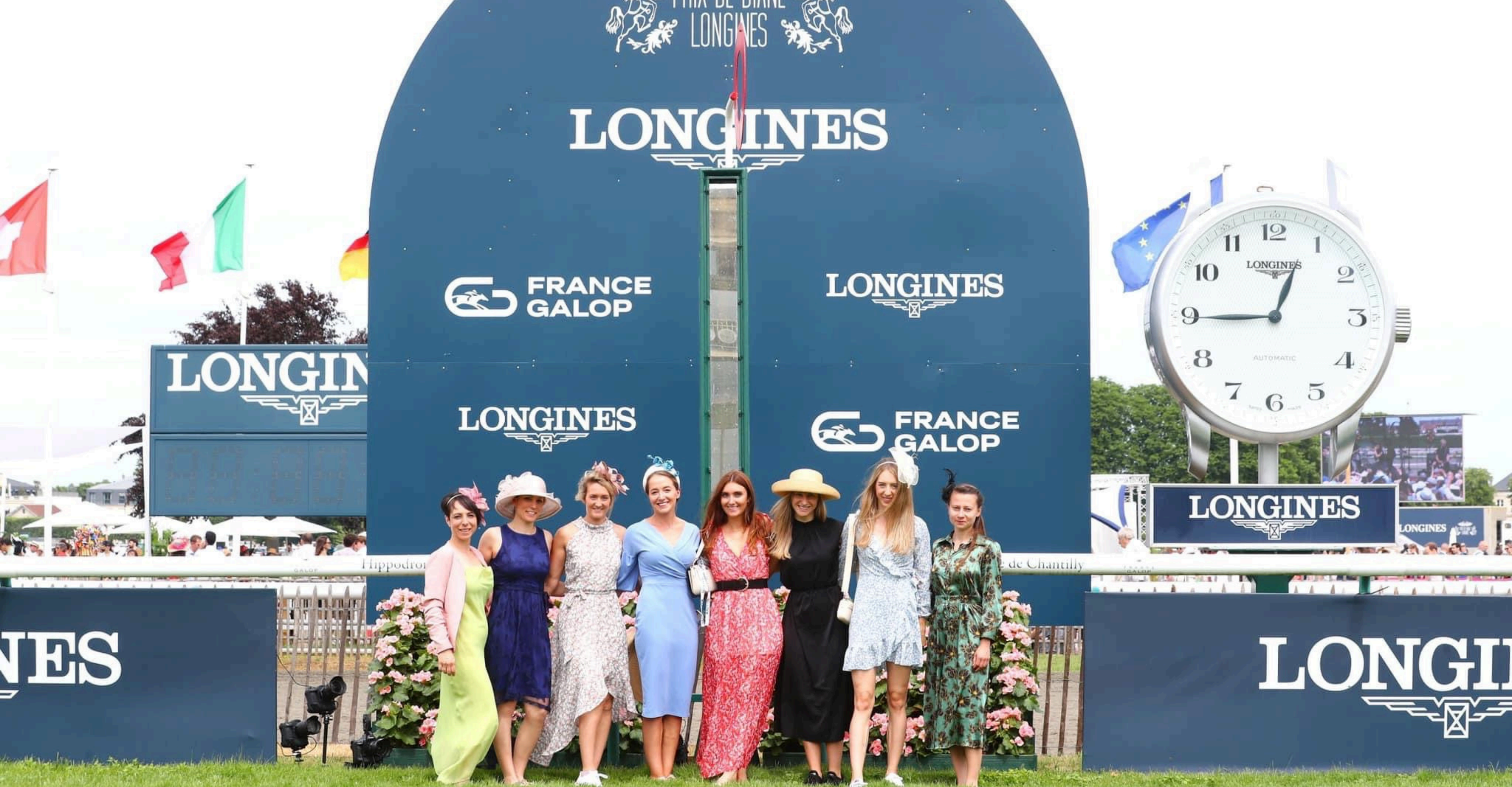
FEAGENTRI Riders at Chantilly, France – Elegance on Prix de Diane day.