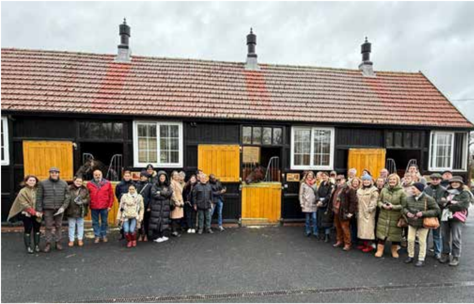
The FEGENTRI participants at Dalham Hall Stud