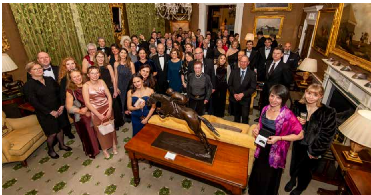
The FEAGENTRI Gala participants at the Jockey Club Rooms